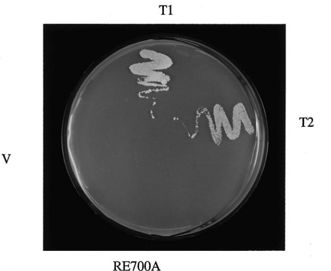
Fig. 1. Growth of S. cerevisiae RE700A transformed with a construct expressing AmMST1 and the vector without insert. (T1 and T2) independent transformants containing the AmMST1 expression vector, (V) yeast transformant containing the expression vector without insert, (RE700A) untransformed yeast mutants were grown on agar plates containing 2% glucose as a sole carbon source.

while monosaccharide concentrations above this threshold caused a 4-fold increase of the amount of the AmMST1 transcript. An increase of AmMST1 expression, similar to that found in fungal mycelia when cultivated at elevated monosaccharide concentrations, was also observed in symbiosis of A. muscaria with both the gymnosperm Picea abies and the angiosperm Populus tremula×tremuloides . It can thus be assumed, that the increase of AmMST1 expression in mycorrhizas is also sugar-regulated and depends on the in vivo concentration of monosaccharides at the fungus/plant interface.