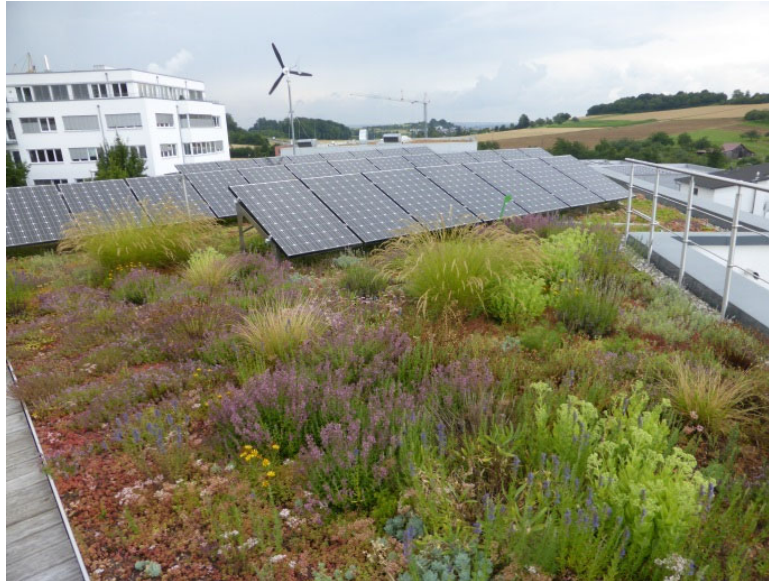
Figure 2. Combinations of vegetation and solar panels on green roofs, such as on this roof by ZinCo, Germany, can increase habitat heterogeneity. (Photo: A. Z.).

Shade can be fostered by an increase in plant cover, which increased the richness of true bugs in 115 green roofs across France [501, and the richness of C3-, C4-grasses, and forbs on 10 green roofs in New York [71]. Recently, solar panels, which can be installed on green roofs (Figure 2), were suggested as ways to create shady sites, with the change of shaded and non-shaded roof areas increasing habitat heterogeneity [72,73].