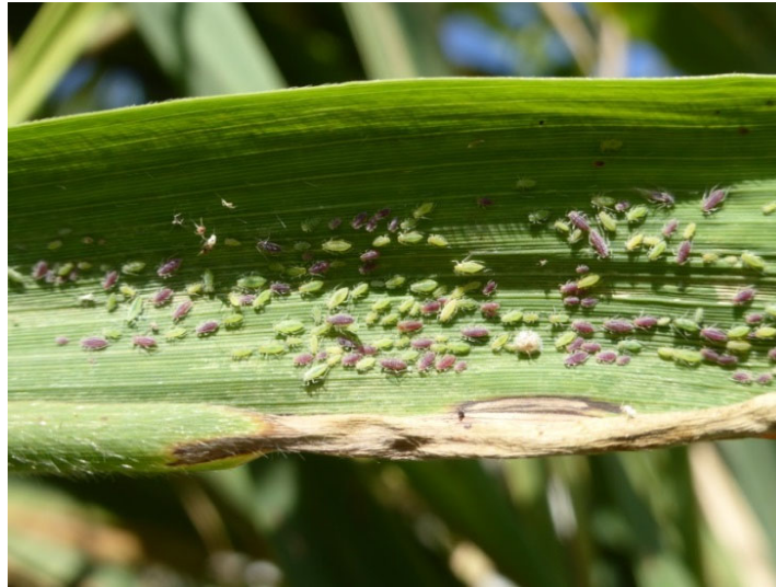
Figure 6. Aphids feeding on Phragmites australis in a constructed wetland.