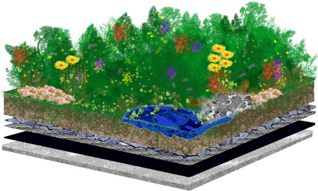
Figure 7. Scheme showing the possible appearance of a biodiverse green roof, based on recommendations by Germany’s Federal Agency for Nature Conservation [81]: A structurally diverse roof with vegetation, substrate, gravel, stones, dead wood, and puddles will provide a range of niches that can be occupied by a range of species. The basic layers that make up a green roof are shown as well with (from bottom to top) the roof itself, gravel as drainage system and substrate. (Picture: S. S.).

as nesting holes for other insects. Hiding places can consist of old woods and dead branches. The combination of different nest boxes for insects can be a good solution, to begin with. For winter time, it is essential that the soil substrate is thick enough ( \geq 15 cm see [81]), as thin soil will completely freeze during frost periods and consequently kill animals overwintering in soil [157]. This would result in an insect-free roof in spring and thus a lack of feeding resources for young birds nesting on the roof. For birds on green roofs, too, it is important to install nesting boxes for ground-nesters, building-nesters, and for bats [81].