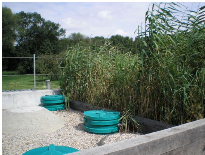
Figure 3. Constructed wetlands usually consist of planted basins where water purification takes place and technical elements such as those seen in the foreground of this photo.

Constructed wetlands (Figure 3) have been successfully applied in a range of countries, especially in the decentralized sector for the treatment of different types of polluted wastewater (municipal or industrial wastewater, contaminated river water). Their success has mainly been assessed in terms of water purification performance. Moreover, constructed wetlands can contribute to maintaining or improving biodiversity, especially in urban areas [120]. However, this aspect has received little attention so far. Assessments of the biodiversity of constructed wetlands have mainly been performed in comparison to natural wetlands or, less frequently, to other constructed wetlands [121]. In urban areas, however, constructed wetlands usually do not replace natural wetlands, instead, they are located on previously disused sites or on sites renatured after the demolition of buildings. To our knowledge, comparative studies of the biodiversity of constructed wetlands vs. disused or renatured urban sites do not exist yet.