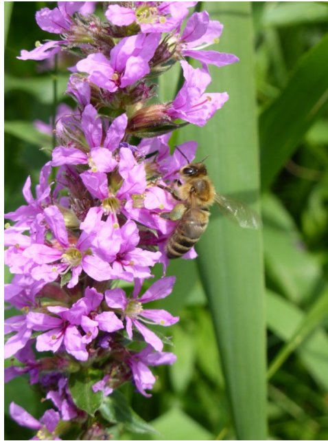
Figure 5. Marsh plants such as Lythrum salicaria provide food resources for insects.