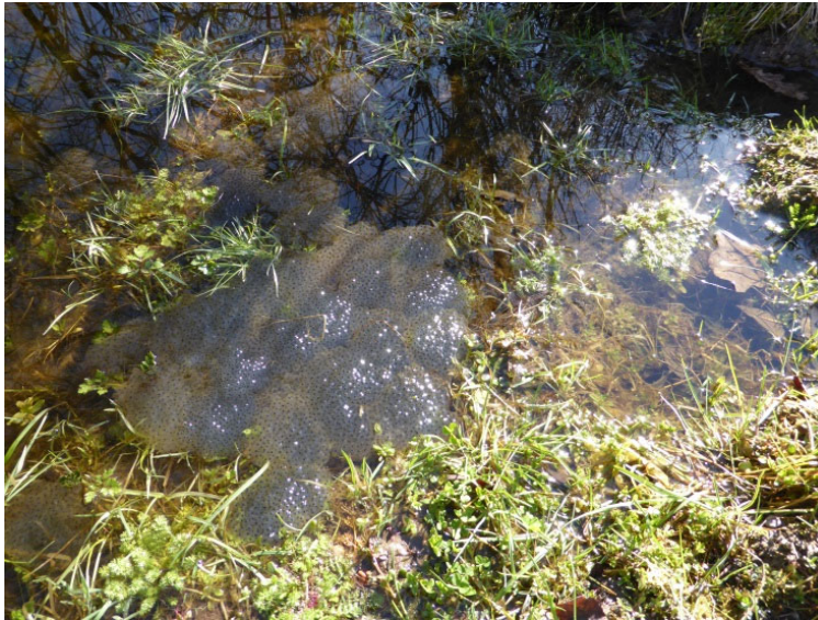
Figure 4. Shallow zones of water within constructed wetlands support spawning amphibians.