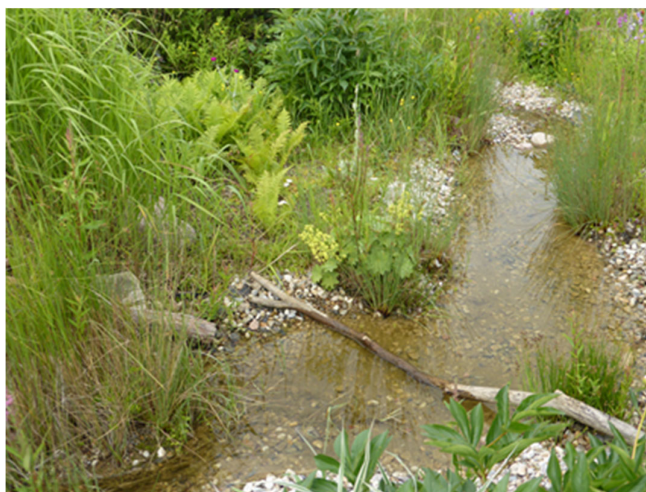
Figure 9. This wetland, which has been integrated into a green roof, supports the presence of plants and animals usually absent from green roofs. (Photo: A. Z.).

The advantages of green roofs and constructed wetlands can be combined in the cramped environment of growing cities by planting wetland plants (Figure 9) on the roofs of buildings [16,182].