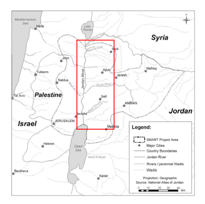
Figure 1: Study Area